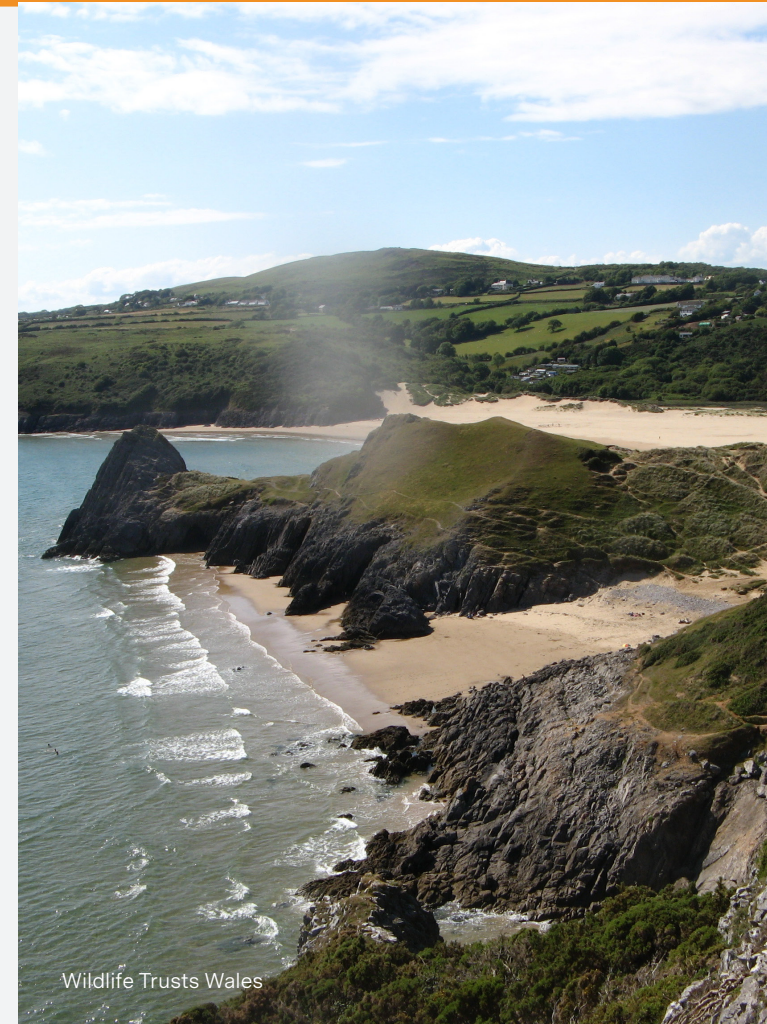
Wildlife Trusts Wales

Throughout the document you will find a number of reports relating to the topic subject. Please read the link if you see this symbol.