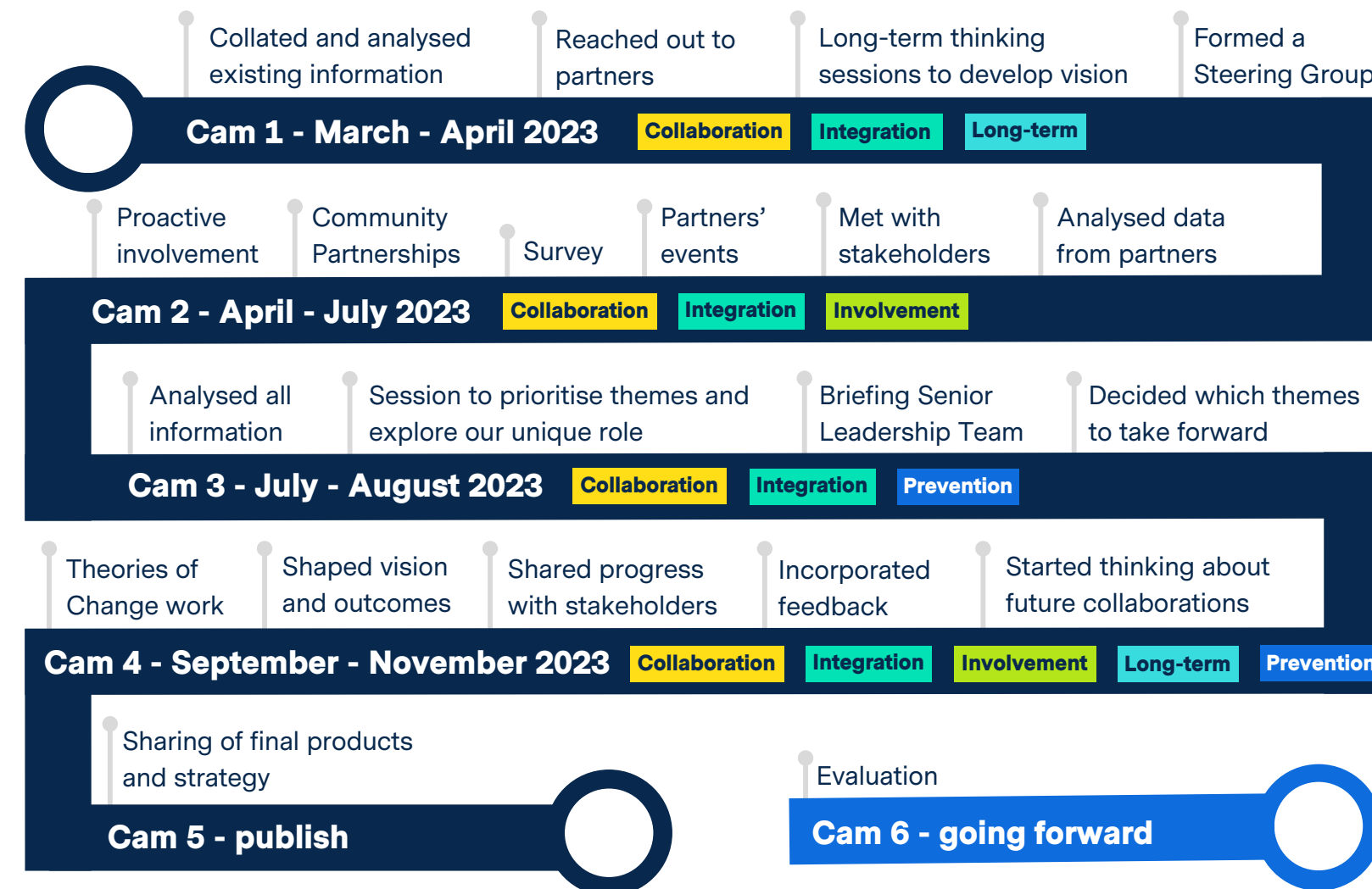
Figure 3: A summary of our timeline

The Cymru Can approach, which has emerged from this work, is anchored in our statutory powers and duties to advise, monitor and review. Across all of the missions we will: