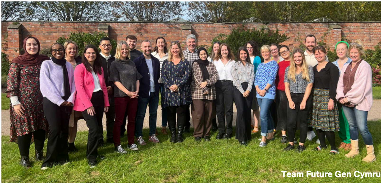
Team Future Gen Cymru